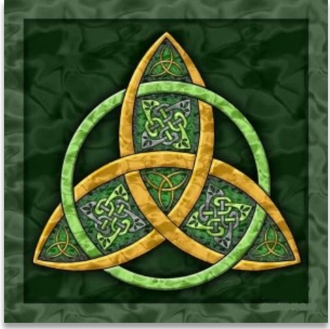
29th August 2021 | 13th after Trinity 10:00am | Group Eucharist at Shelton

9:30am | Eucharist at Woodton 11:00am | Morning Praise at Topcroft 11:00am | Eucharist at Morningthorpe 4:00pm | Church in the Park, Family Praise at Hempnall Church 6:00pm | Evening Service via Zoom