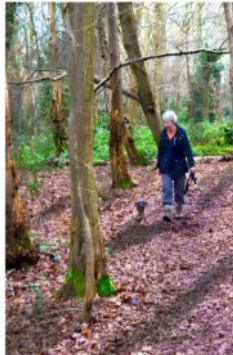
Circular walks in south Norfolk