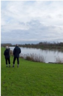
12 Circular walks in South Norfolk