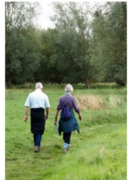
Circular walks in south Norfolk