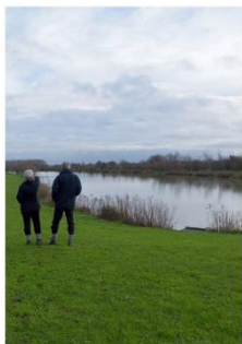
12 Circular walks in South Norfolk