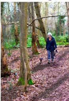
Circular walks in south Norfolk