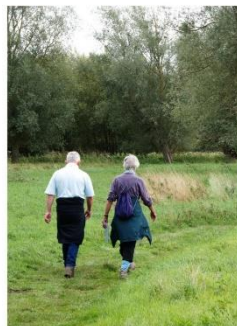
Circular walks in south Norfolk