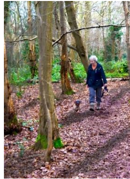
Let's Walk Again

Our very popular Walk Books and The Parish Churches of the Hempnall Group guide are £2 each. Available from the church office, open Mon-Thurs 9am-1pm, 498158, or from Jill Turner 499344.